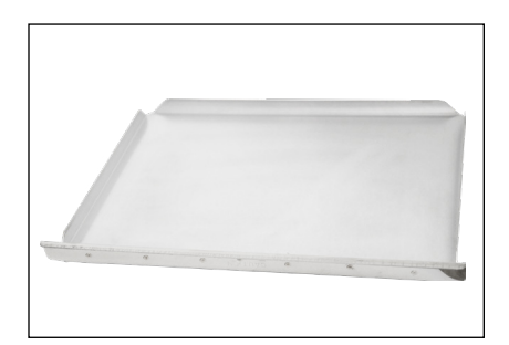
Removable crumb tray