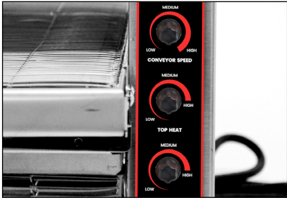
Three control settings